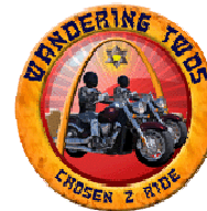
St. Louis, MI

To contact the JMA please go to www.jewishbikersworldwide.com