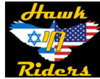
Iowa City, IA