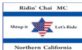
San Francisco, CA