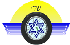
Canaan Cruisers of Tallahassee