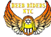
New York, NY